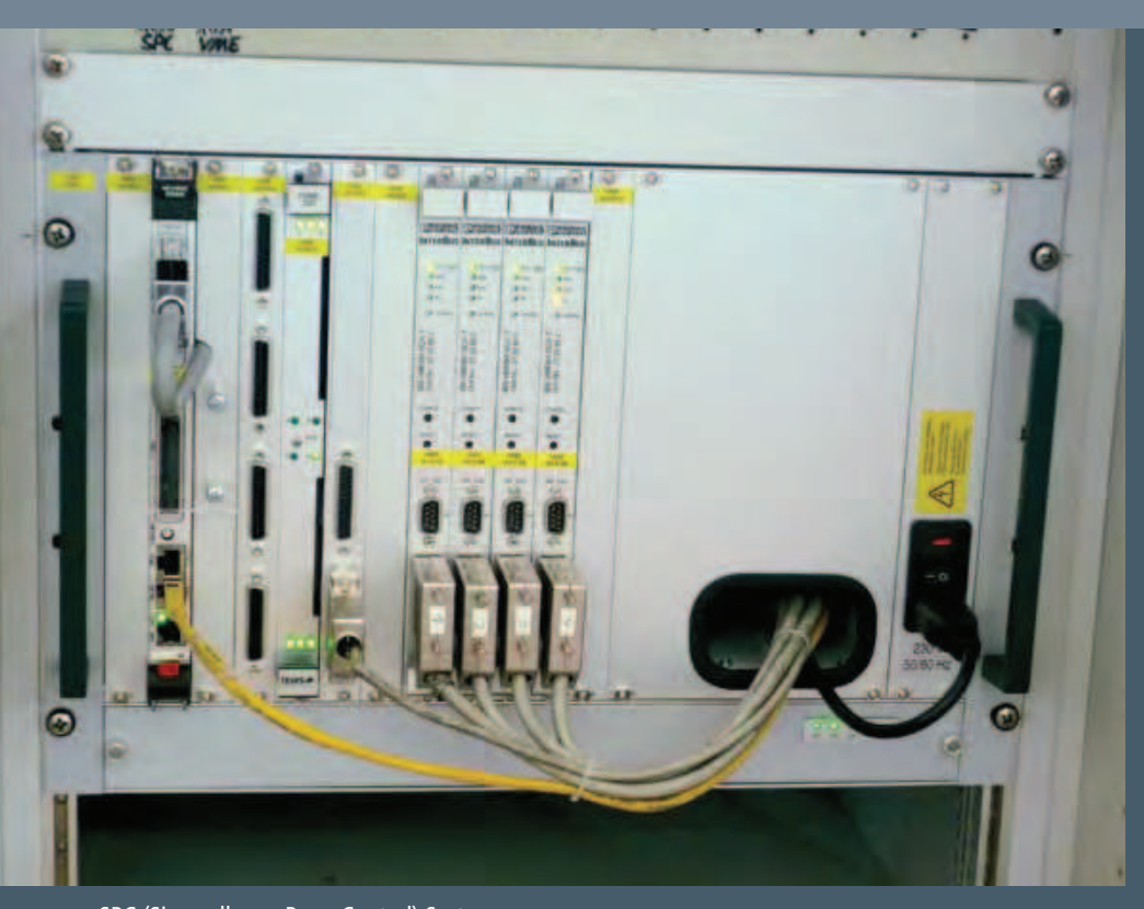
SPC (Siempelkamp Press Control) System