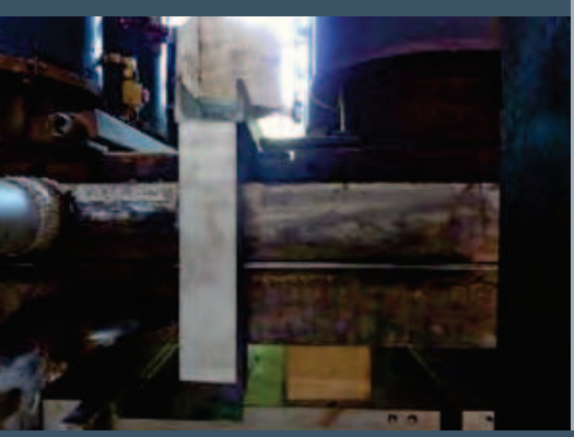
By installing new pressure distribution plates, pressure distribution in the press was improved. As a result, the adhesive bonds cure homogeneously. This, in turn, means that less resin is needed for the same result. To date Siempelkamp has

upgraded the pressure distribution plates for customers four different times: in this plant, in two plants of the Austrian plant operator Egger as well as at Kastamonu in Turkey – the latter as part of a press extension.