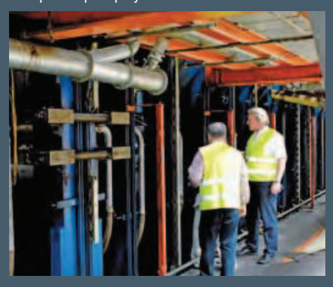
Inspection of the retrofitting works by Siempelkamp employees