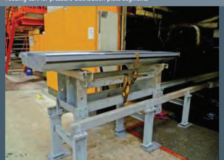
Connection of pressure distribution plates

Feeding cart for pressure distribution plate segments